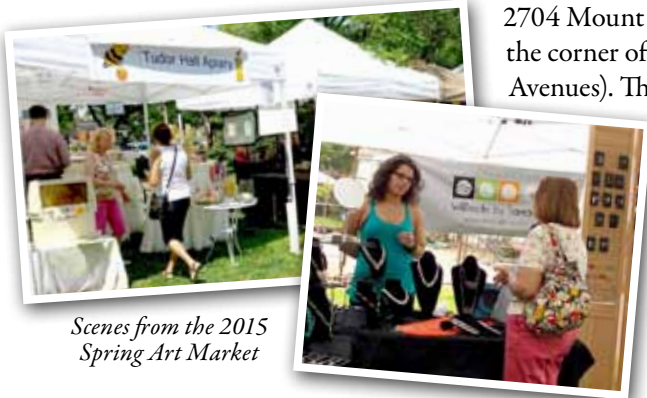
Scenes from the 2015 Spring Art Market