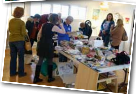
2014 Member Meeting & Art Swap