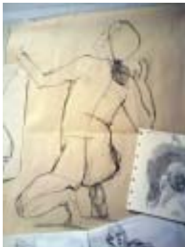
Figure Studies by Pamela Underhill and Katherine Rand on display during the "Drawing Inspiration From The Figure" show, June 2011

Select Wednesdays and Sundays, bring your drawing supplies and join us for life drawing. Sessions run on a drop-in basis. All skill levels are welcome. Fees: $6-8 ($8-10, non-members) depending on session length. For dates and details, see the calendar on DRA's website.