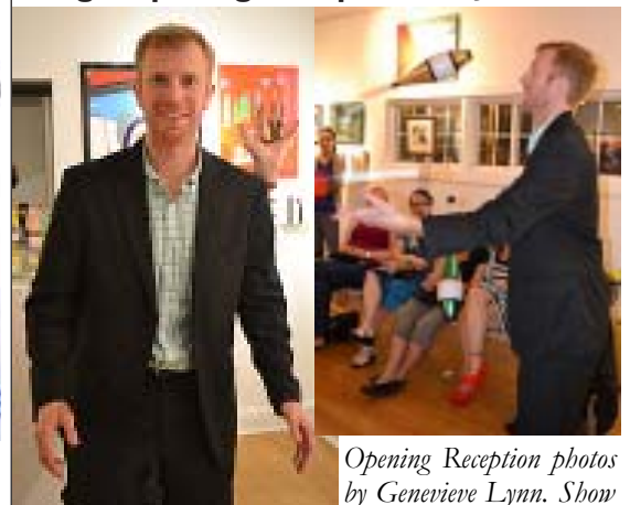
Show