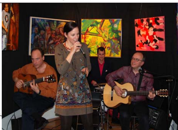
Local jazz band Veronnean entertained at the Opening Reception of "XX" on March 2.