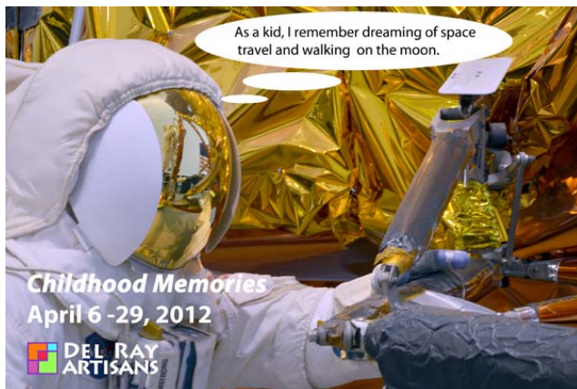
Photograph/Design by David A. Kosar

Ever wondered where artists get their inspiration, what may be on their minds when thinking and creating art — or even more intriguing — what kind of childhood they had? Don't miss our April show, Childhood Memories , featuring works by local area artists inspired by their childhoods. The show explores the endless memories of childhood that are often the inspiration for art. The show features paintings, drawings, photographs, collages, sculptures, traditional and abstract concepts, and various visual media.