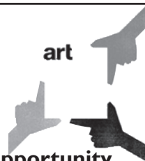
Exhibit Opportunity at Signature Theatre

"An empty canvas is a living wonder... far lovelier than certain pictures." Kandinsky