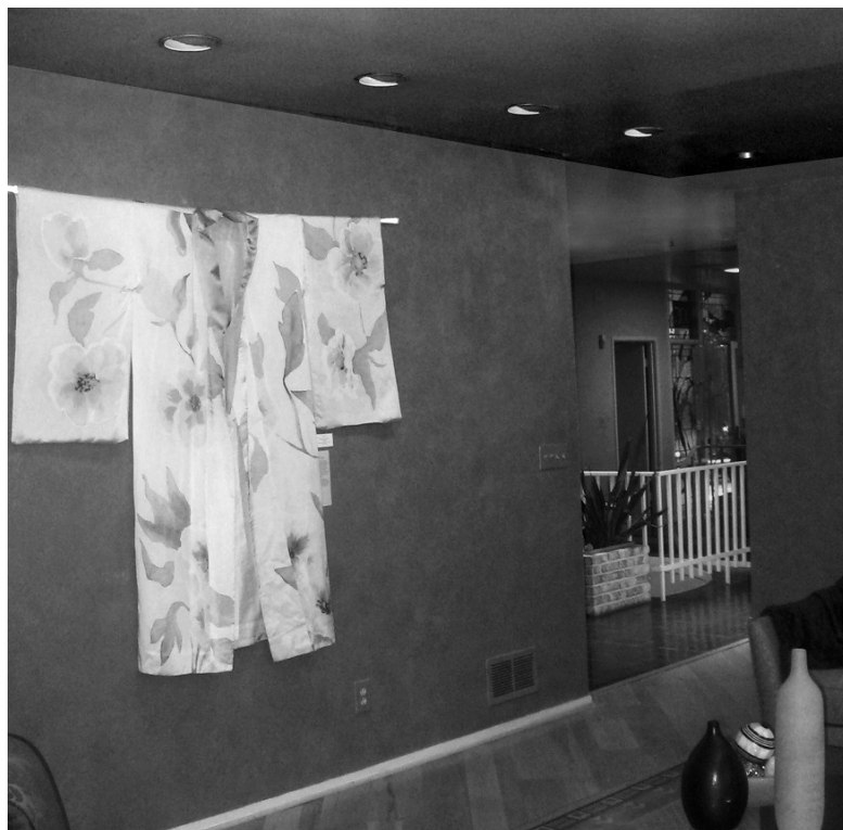
Linda Silk's handpainted kimono is used to stage a house for sale.

Lynn Chevalier, ASP, IAHS 202.412.6445 or 703.992.6353 lynn@stagedrightva.com