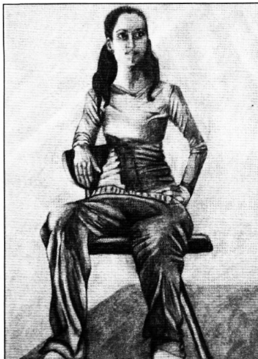
Hillary Clausen, Pencil Drawing from Life 18 x 24