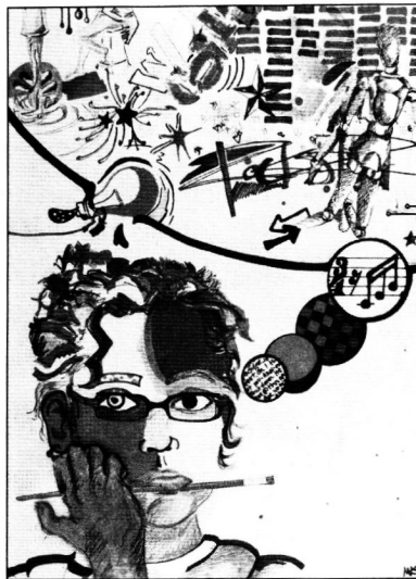
M.K. Cosier, Mixed Media 12 x 18