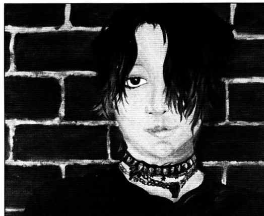
M.K. Cosier, Acrylic on Canvas, 12 x 18